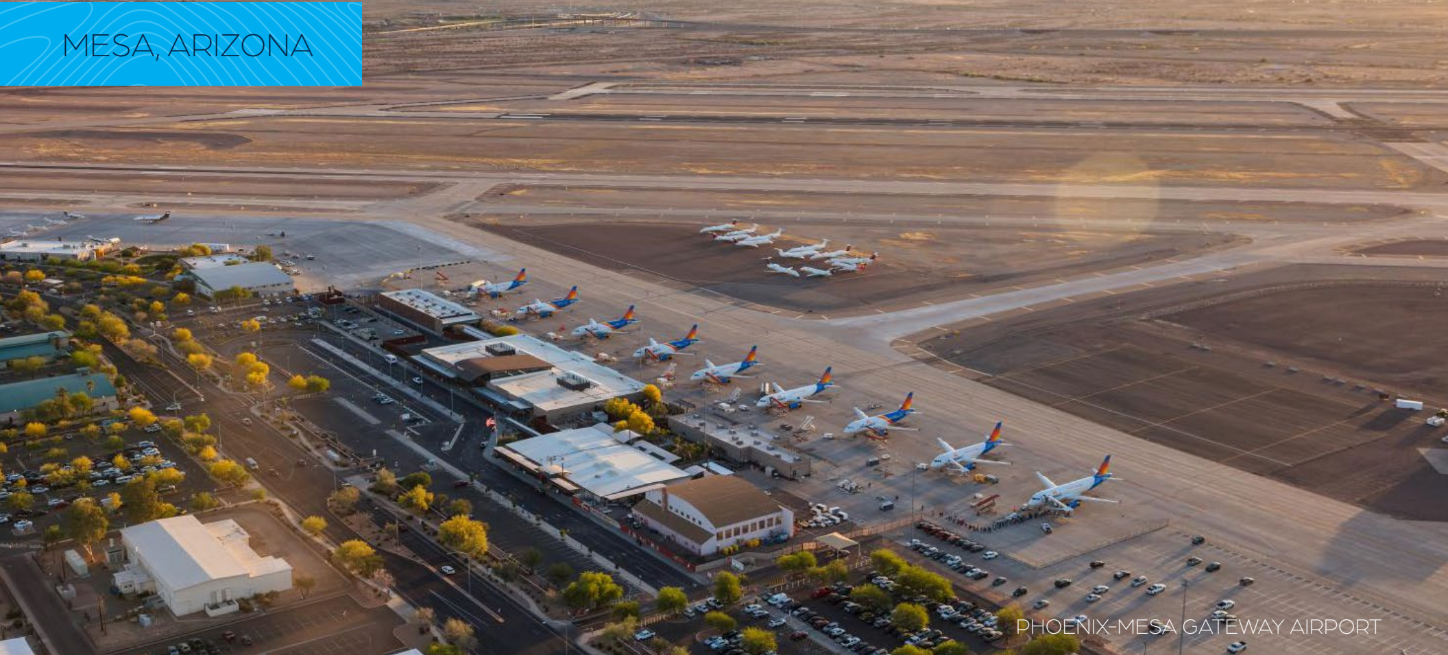
PHOENIX-MESA GATEWAY AIRPORT